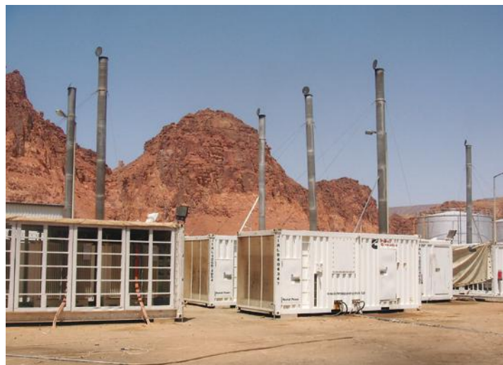
Prime power for a 65 MW power plant at Ula, Saudi Arabia

To meet the increasing demand for electricity, the PowerBox 20X unit comes in a standard ISO container for easy transportation across borders and regions. The CSC-certified modules can be shipped around the world like regular containers, which means lower freight and transportation costs.