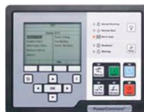
PowerCommand 3.3 control operator/display panel